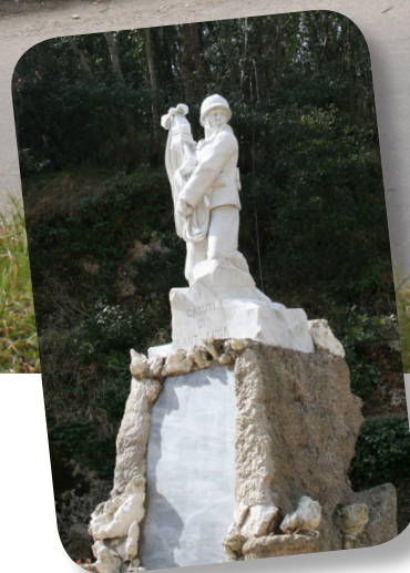
Sant'Anna di Stazzema

on 12th August 1944 the human barbarity reached one of the most deep abyss.