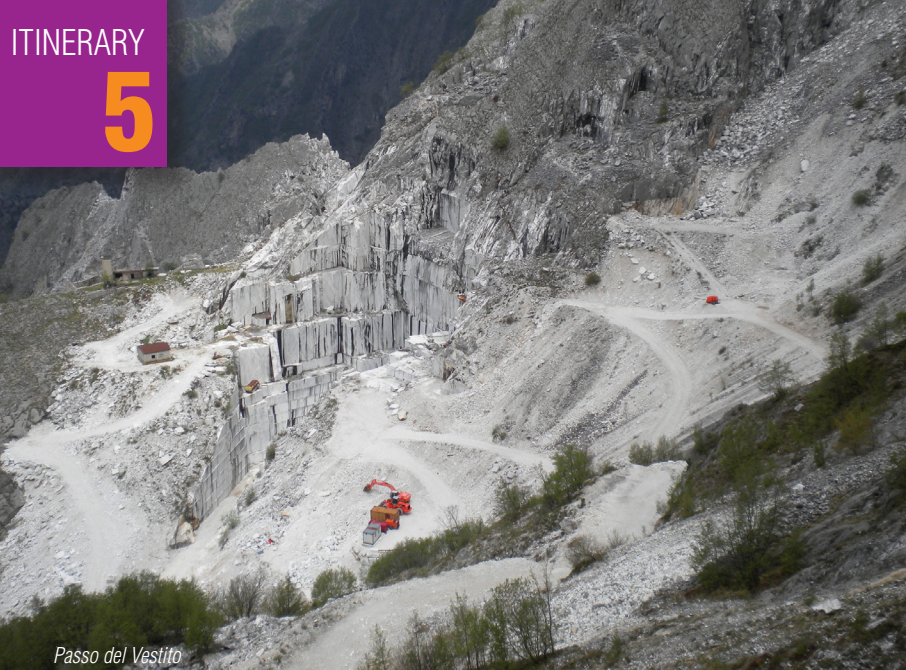
Passo del Vestito

other 3 km you'll reach Levigliani, famous for the Corchia caves, a natural cavern that you can visit all year round (for information 0584 778405 www.antrocorchia.it ). After 5 km you'll reach the Cipollaio tunnel where you can have a break and admire the scenery. The long tunnel (1,2 km) is badly lit and it is at the beginning of a descent along breathtaking defiles. After 1 km at the fork turn right and follow road signs to Massa. Here the harder part of our excursion begins, with stretches with a 10% and a 12 % gradient inside Arni hamlet and after the tunnel also (badly lit). When you reach the peak, with splendid weather especially, your eyes are filled with unexpected views and at the end of the Vestito tunnel the scenery is more amazing. Be careful