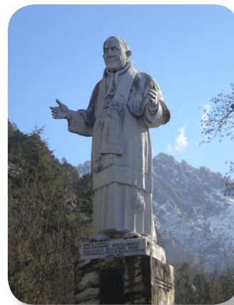
Papa Giovanni XXIII Statue, Antona

ies that through Antona and San Carlo will accompany you until Massa. Here reach the seafront of Marina di Massa through Viale Roma, a wide sloping road. At the seafront turn right and going through Cinquale, Forte dei Marmi, Marina di Pietrasanta and Lido di Camaiore you'll finally return to your starting point. Obviously, being a ring itinerary, you can rise to passo del Vestito going through Massa, with a longer but more gentle rise (so to speak).